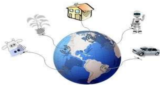
Fig 1: Internet of Things (IoT) technology

In 1999 Auto- ID labs and MIT sought to develop Electronic Product Code EPC, and use RFID to identify things on the network. In 2003-2004 the emergence of projects serving IoT idea such as Cooltown, Internet0, and the Disappearing Computer initiative, also IoT start to appear in book titles for the first time. RFID is deployed was published on a massive scale by the US Department of Defense. In 2005 IoT entered a new level when published its first report by International Telecommunication Union ITU. In 2008 a group of companies such as Cisco, Intel, SAP and over 50 other members of companies met to create IPSO Alliance, to promote the use of Internet protocol (IP) and to activate IoT concept. In 2008-2009 IoT was "Born" by Cisco Cisco Internet Business Solutions Group (IBSG) [8]. From the previous perspectives can be defined IoT as a set of smart things/objects such as home devices, mobile, laptop, etc., addressed by a unique addressing scheme and connected to the Internet through a unified framework this framework may be cloud computing. Fig 1 depicts IoT technology.