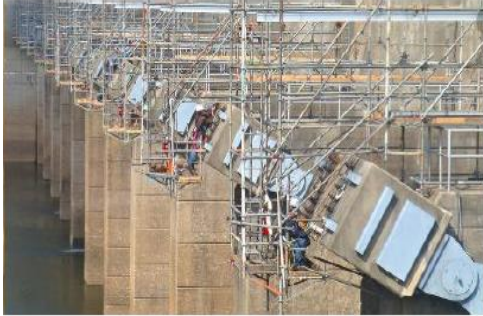
Figure No. 2 External Post Tensioning to restore or increase capacity