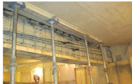
Figure No. 1 External Post Tensioning

Periods. Retrofitting is a technological and scientific approach based on recent developments, where modern methods and construction materials are used for repairing and reinforcing historical structures. The use of reinforced concrete is suggested in the form of cast-in walls, jackets or straps;