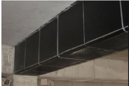
Figure No. 3 Carbon FRP fiber installation

Composite wraps or carbon fiber jackets are used for reinforcing and adding ductility to reinforced concrete and maceration components without any penetration. Composite wraps on reinforced concrete columns are most effective. Additional containment provided.