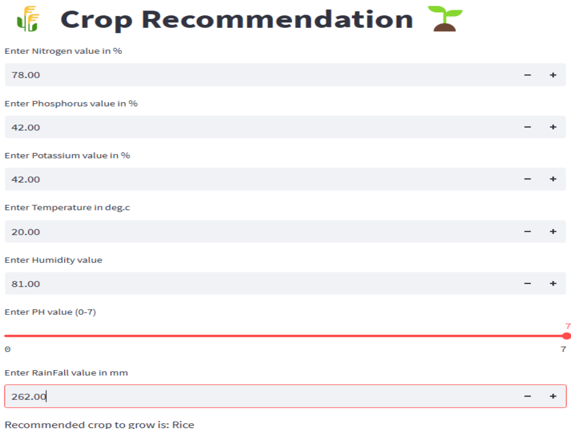
Fig 2: Recommended Crop

Results reveals that Random Forest is the best classifier when all parameters are combined. This will not only help farmers in choosing the right crop to grow in the next season but also bridge the gap between technology and the agriculture sector.