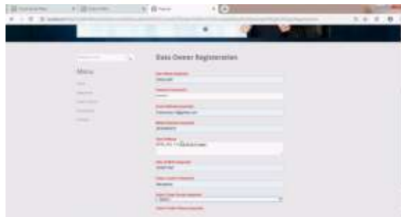
Fig 7 Data Owner Registration