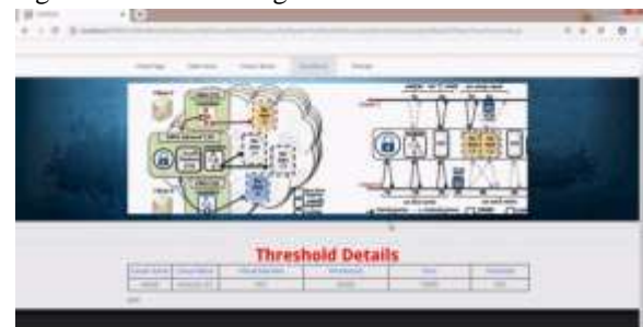
Fig 5 Threshold Details