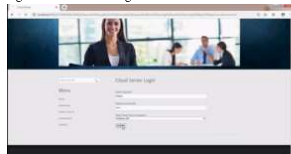
Fig 4 Cloud Server Login