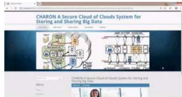
Fig 3 Home Screen Login