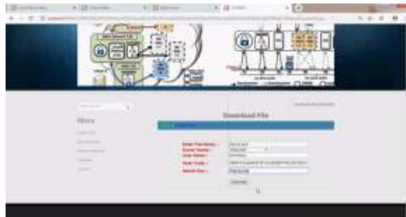
Fig 8 Download File