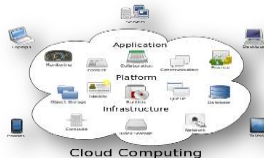
Fig 1 Example Figure

More often than not, virtualization is utilized to benefit from cloud PCs.