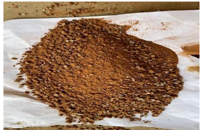
Figure 3: Demolished Brick waste (DBM).

Several million tons of solid waste are generated worldwide from construction and demolition operations, with brick waste being one of the most notable types of waste. More studies on recycling brick wastes to create more environmentally friendly concrete have been conducted in recent years. Bricks are an item that can be recycled. Reusing brick can benefit the environment, provide financial benefits, and inspire creative ideas for remodeling projects. In the below figure 3, it is showing the demolished brick waste.