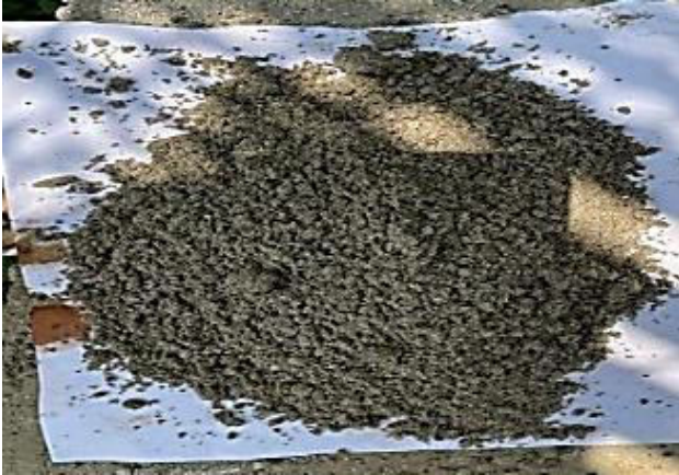
Figure 4: Recycled Concrete waste (RCW)

construction and demolition debris is produced each time a building or civil engineering structure is constructed, renovated, or demolished. Two methods exist for using waste in the construction industry: recycling (converting waste into raw materials used to produce building materials) and reusing (reusing components). In the below figure 4, it is showing the Recycled Concrete waste.