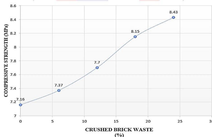
Figure 2: Compressive strength vs percentage of crushed brick waste