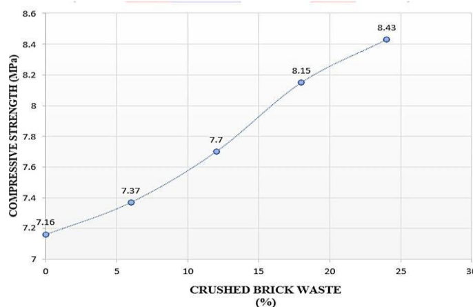
Figure 2: Compressive strength vs percentage of crushed brick waste