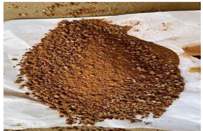
Figure 3: Demolished Brick waste (DBM).

Several million tons of solid waste are generated worldwide from construction and demolition operations, with brick waste being one of the most notable types of waste. More studies on recycling brick wastes to create more environmentally friendly concrete have been conducted in recent years. Bricks are an item that can be recycled. Reusing brick can benefit the environment, provide financial benefits, and inspire creative ideas for remodeling projects. In the below figure 3, it is showing the demolished brick waste.