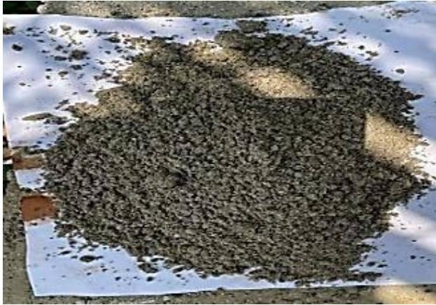
Figure 4: Recycled Concrete waste (RCW)

construction and demolition debris is produced each time a building or civil engineering structure is constructed, renovated, or demolished. Two methods exist for using waste in the construction industry: recycling (converting waste into raw materials used to produce building materials) and reusing (reusing components). In the below figure 4, it is showing the Recycled Concrete waste.