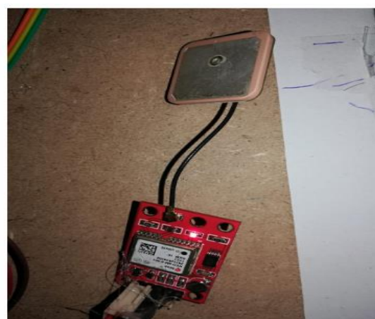
Fig.2. GPS module.