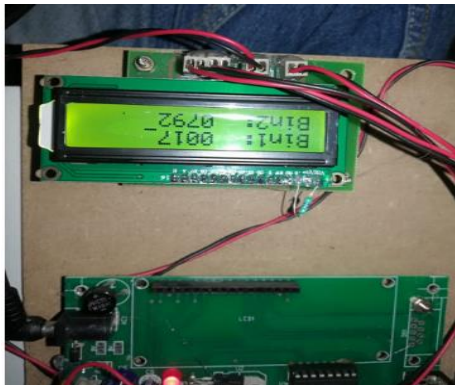
Fig.3. Dust bins status. OUTPUT RESULTS WITH LOCATION:

Here we are using WIFI module we get latitude and longitude values from predefined values in program.