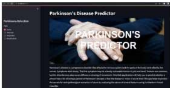
Data info page