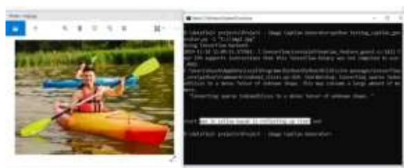
Fig 5 Output Screen