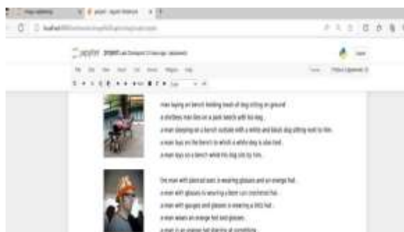
Fig 3 Output Screen