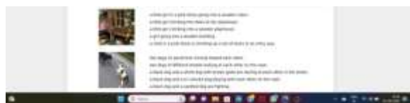
Fig 4 Output Screen