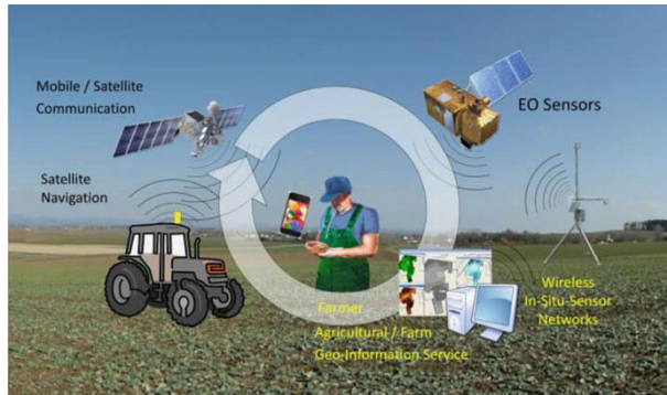
Fig. 1 Information flow in TalkingFields. Space-based components play an essential role in smart farming information services for farmers