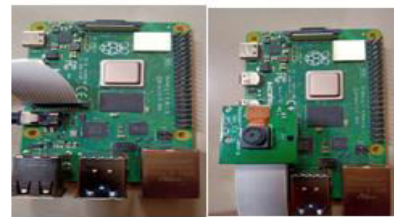
Figure 1 Circuit Diagram

You can choose one OS; you should compose it to a SD card utilizing a Disk supervisor application. You can likewise utilize other capacity system, as USB outside hard drive or USB drive. There are a various brands of SD cards are accessible in the business sector in various sizes.