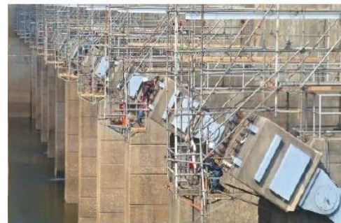
Figure No. 2 External Post Tensioning to restore or increase capacity