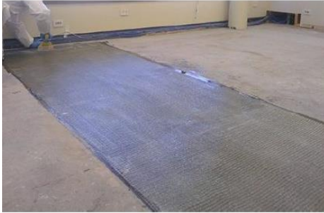
Figure No. 4FRP Composite Strengthening services Concrete solutions