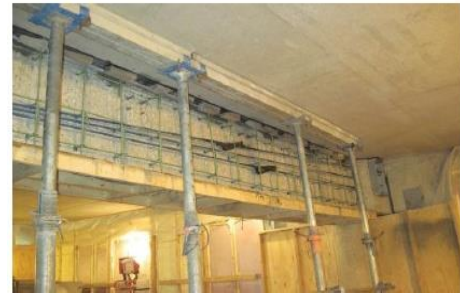
Figure No. 1 External Post Tensioning

One of the potentially efficient retrofit options for reinforced concrete or masonry buildings is the post-tensioning (Fig1). Masonry's compressive strength is relatively large, but the strength is only low. Therefore, it is the most effective in carrying loads of gravity. Induced tensile stresses usually exceed pressure and reinforcement to provide the necessary strength and ductility, must be added.