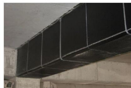
Figure No. 3 Carbon FRP fiber installation

Composite wraps or carbon fiber jackets are used for reinforcing and adding ductility to reinforced concrete and maceration components without any penetration. Composite wraps on reinforced concrete columns are most effective Additional containment provided.