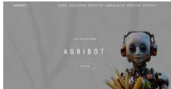
Fig 6.2 Home page