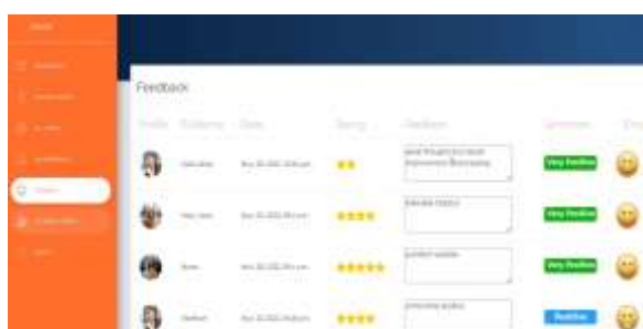
Fig 6.7 Feedback page