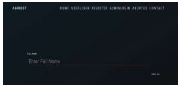
Fig 6.3 Register page