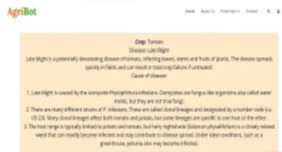
Fig 6.1 Index Page