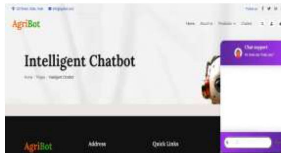
Fig 6.9 Chatbot Page