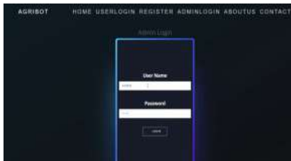
Fig 6.5 Admin login page