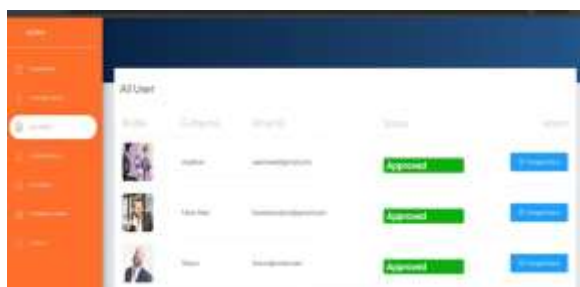
Fig 6.6 Admin Details