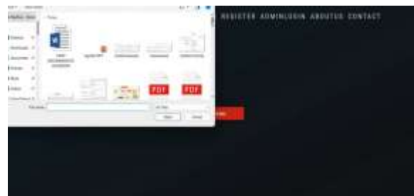
Fig 6.4 Upload image