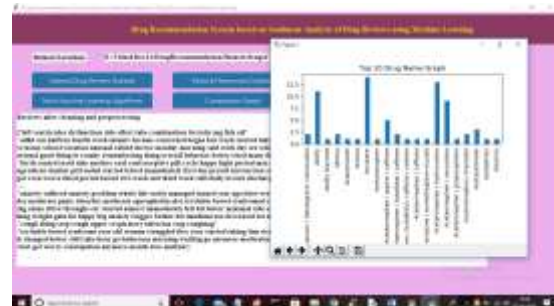
Fig.4. Top 20 Drug Name Graph

In above graph we can see dataset loaded and in graph x-axis represents ratings and y-axis represents total number of records which got that rating. Now close above graph and then click on 'Read & Preprocess Dataset' button to read all dataset values and then preprocess to remove stop words and special symbols and then form a features array.