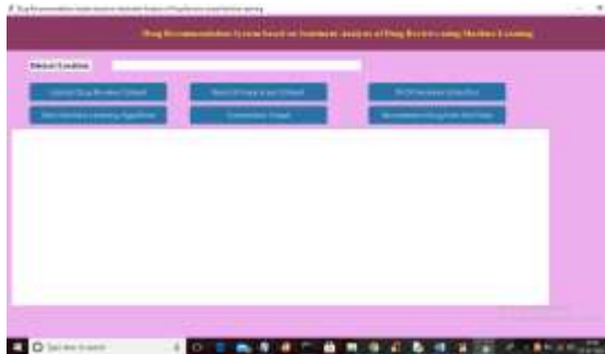
Fig.1. Home page

CLEINT User has to register and login for accessing the files in the cloud. User is authorized by the cloud to verify the registration. User has to View All Files Download.