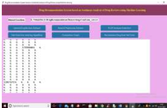
Fig.6. Word Average frequency(non-zero)

In above graph all reviews converted to TF-IDF vector where first row represents review WORDS and remaining columns will contains that word average frequency and if word not appear in review then 0 will put. Now scroll down above screen to view some non-zero frequency values