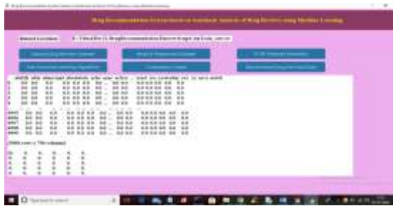
Fig.5. Word Average Frequency

In above graph all reviews converted to TF-IDF vector where first row represents review WORDS and remaining columns will contains that word average frequency and if word not appear in review then 0 will put. Now scroll down above screen to view some non-zero frequency values