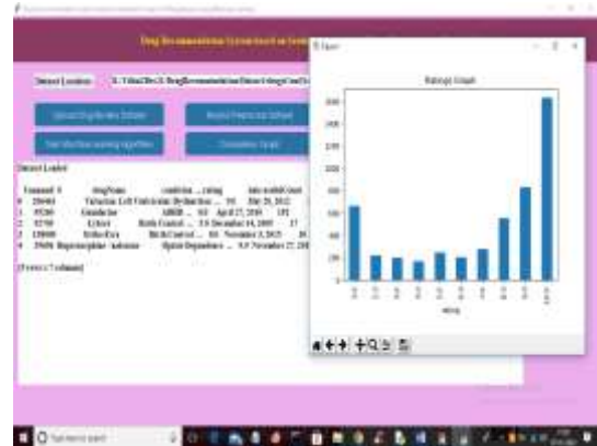
Fig.3. Ratings Graph

In above screen selecting and uploading DRUG dataset and then click on 'Open' button to load dataset and to get below screen