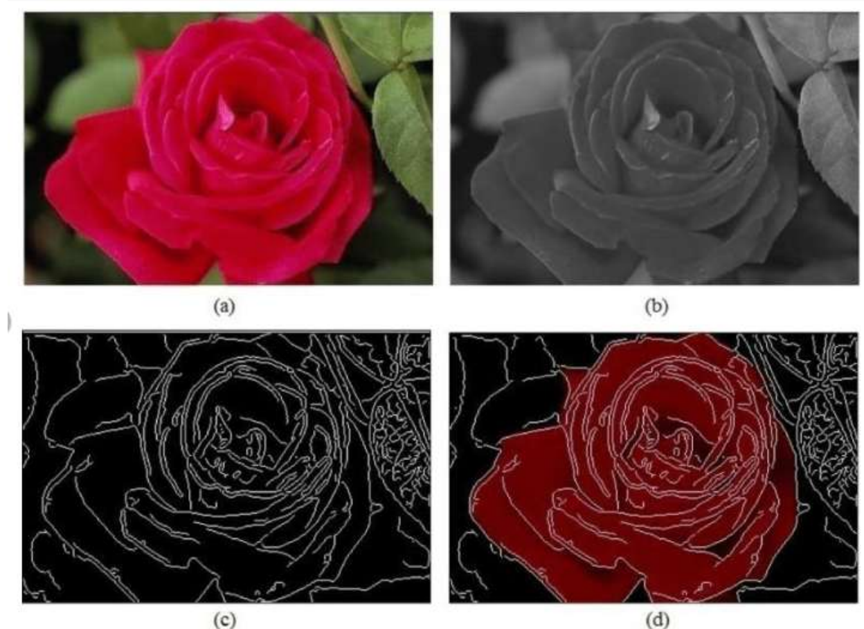
Fig. -Examples of color

Several methods are available for retrieving images on the basis of Color. A color histogram shows the proportion of pixels of each color within the image. While searching any image, the user can either specify the desired proportion of each color, or submit an example or query image from which a color histogram is calculated. The matching process retrieves those images whose color histograms match with those of the query image [5]. The color is one of the most widely used visual features in image retrieval. Most of the images are in the red, green, blue (RGB) color space. Other spaces such as hue, saturation, value (HSV) and LUV spaces are much better with respect to human perception and are more frequently used. Color features are often easily obtained directly from the intensity of the pixel, e.g. color histogram over the whole image or over a segmented region is often used [6][7].