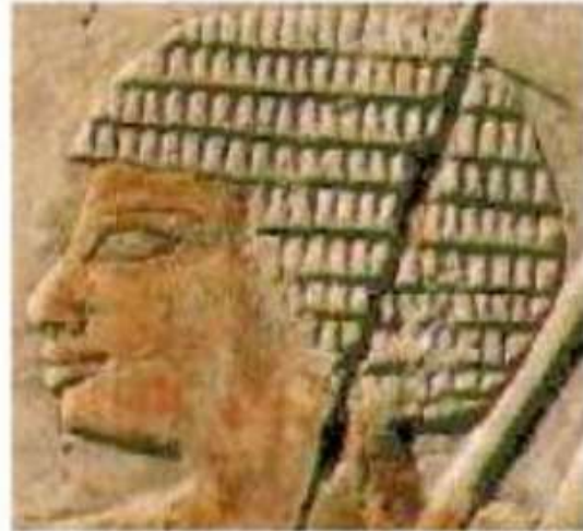
Fig. -Examples of Texture

Texture measures have an even larger variety than color measures. Some of the most common measures for capturing the texture of images are wavelets and Gabor filters. These texture measures try to capture the characteristics of the image or image parts with respect to changes in certain directions and the scale of the images. This is most useful for region or images with homogeneous texture [6]. Texture is a key component of human visual perception. This makes it an essential feature to consider when querying image databases. One can easily identify texture but, it is more difficult to define. Unlike color, texture occurs over a region rather than at a point. It is normally defined purely by grey levels and as such is orthogonal to color. Texture has qualities such as periodicity and scale; it can be described in terms of direction, coarseness, contrast and so on [11].