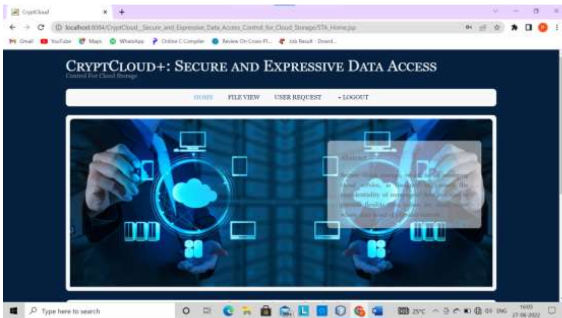
Fig 8: STA's home page after login of STA