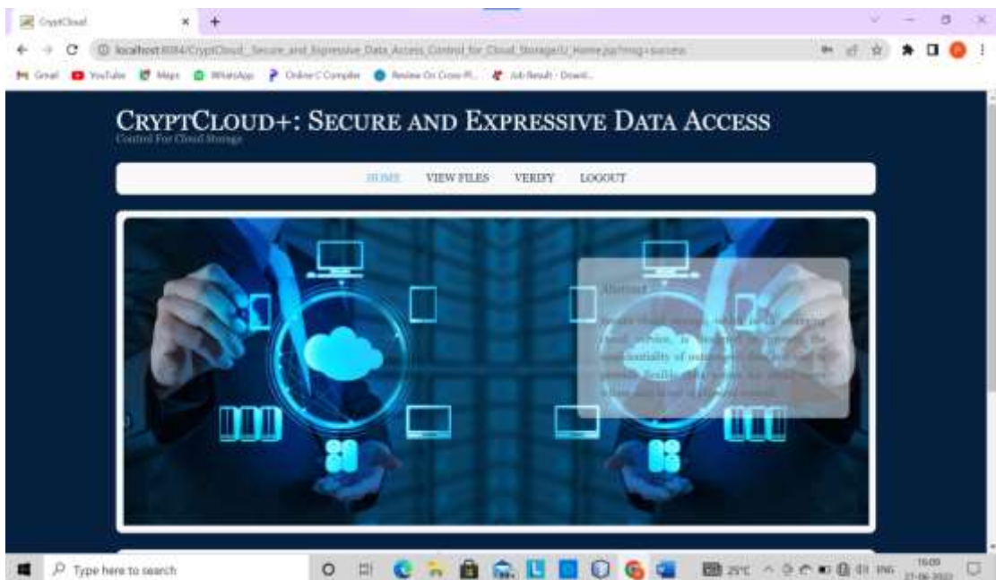
Fig 3: Data user's home page after login of data user