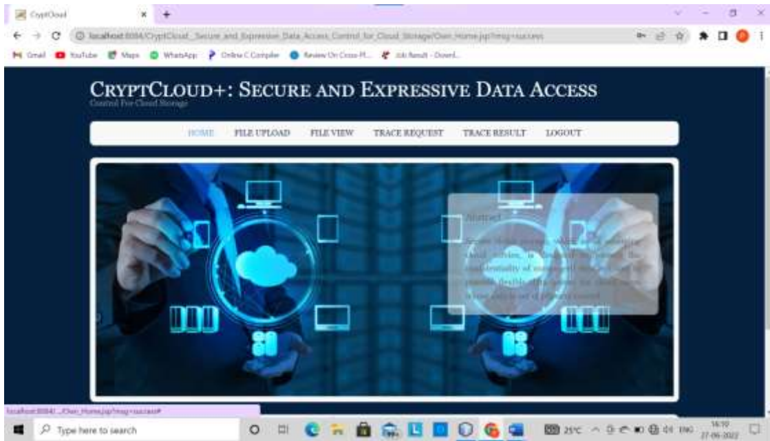
Fig 5: Data owner's home page after login of data owner