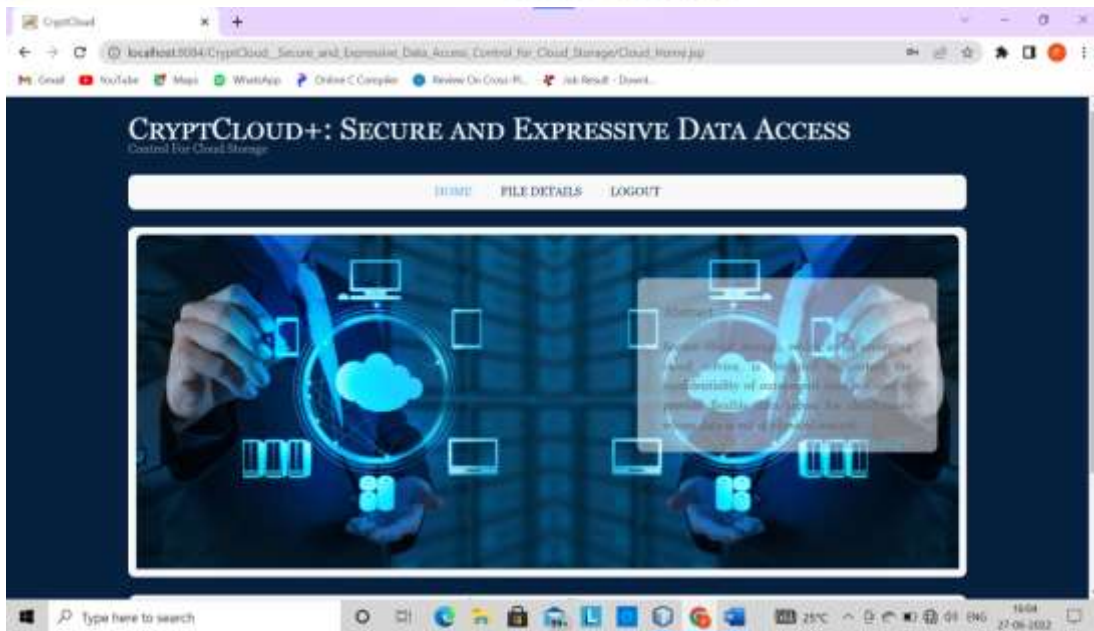
Fig 7: Cloud's home page after login of cloud