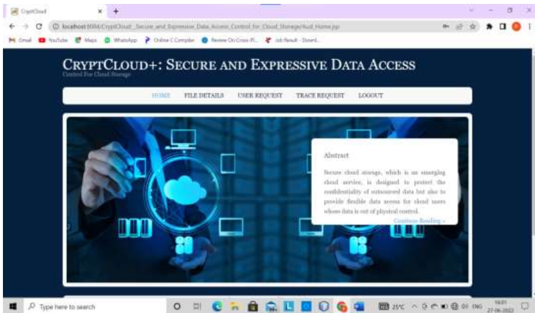
Fig 6: Auditor's home page after login of auditor