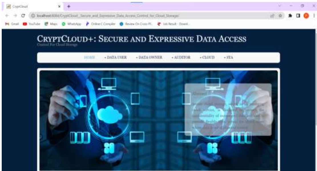
Fig 2: Home Page of Crypt cloud