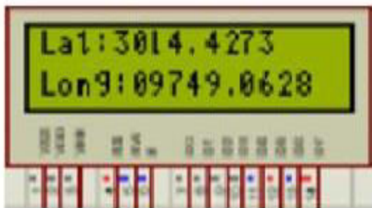
Fig.4.3. Output in LCD

IoT module will track the current location of the victim and it will update the location on the webpage. The microcontroller will switch ON the buzzer in the device, so that nearby people may come to know that someone is in danger and they will come to rescue.