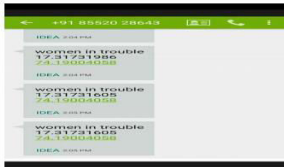
Fig.4.2. Output results.

IoT module will track the current location of the victim and it will update the location on the webpage. The microcontroller will switch ON the buzzer in the device, so that nearby people may come to know that someone is in danger and they will come to rescue.