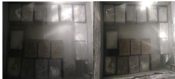
Fig. 5: Water curing.

The method of curing adopted was the ponding method of curing and produced samples were cured for cubes at 7days, 14days, 28 days and beams at 28days.