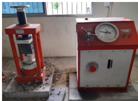
Fig. 7: Compressive Strength test of cube sample.

The compression test was conducted according to IS 516-1959. This test helps us in determining the compressive strength of the concrete cubes. The obtained value of compressive strength can then be used to assess whether the given batch of that concrete cube will meet the required compressive strength requirements or not. For the compression test, the specimen's cubes of 15 cm x 15 cm x 15 cm were prepared by using hwa concrete as explained earlier. These specimens were tested under universal testing machine after 7 days, 14 days and 28 days of curing. Load was applied gradually at the rate of 140kg/cm 2 per minute till the specimens failed. Load at the failure was divided by area of specimen and this gave us the compressive strength of concrete for the given sample.