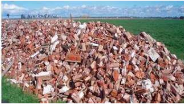
Fig. 1: Constructional waste.