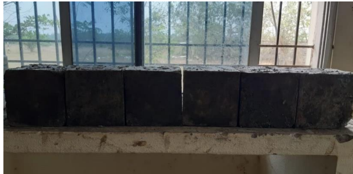
Fig. 4: Concrete mould after demoulding.

The samples were then stripped after 24hours of casting and are then be ponded in a water curing. As casted, a total of (63) 150×150×150mm cube specimens were produced.