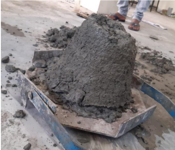
Fig. 6: Slump cone test.