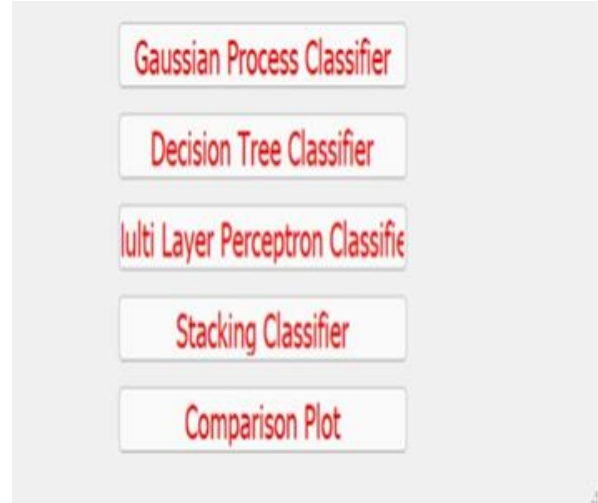
Fig. 1. Home page.

very advantageous for embedded development teams.