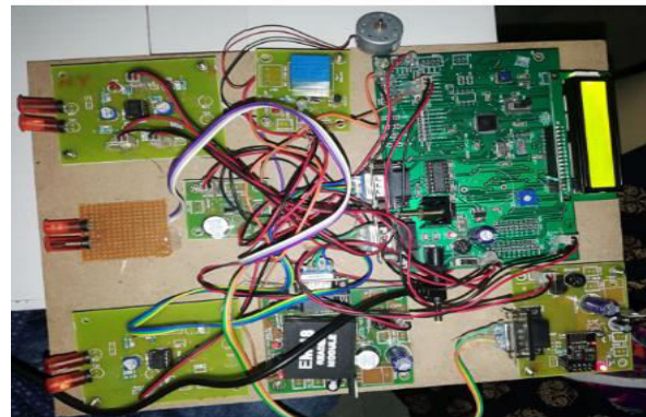
Fig.3.1. Working model.

This manner the consumer can without problems discover a parking spot with none congestion and in much less time.